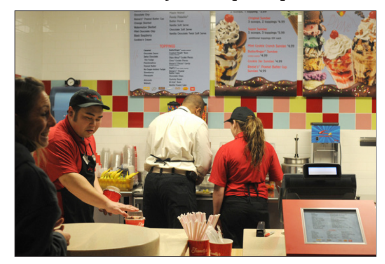
Friendly's Scoop Shop